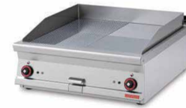
SMOOTH & RIBBED GRIDDLE - TABLE TOP