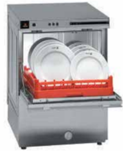
UNDER COUNTER DISH WASHER