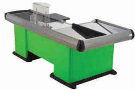
CHECK OUT COUNTER