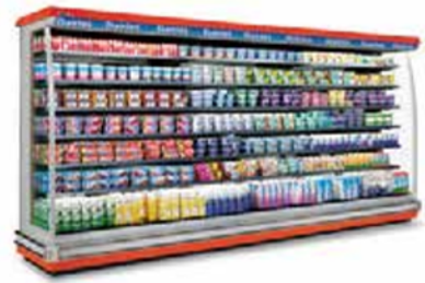
MULTI DECK CHILLER REMOTE UNIT