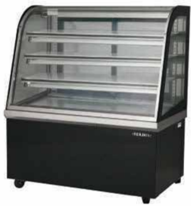
PASTRY DISPLAY CHILLER / HOT