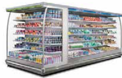
MULTI DECK CHILLER