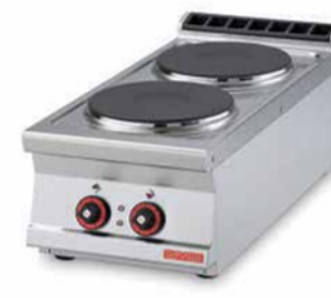
2 HOT PLATE TABLE TOP