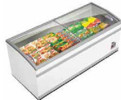
GLASS TOP FREEZER