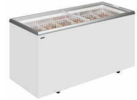
GLASS TOP FREEZER