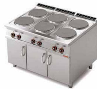
6 HOT PLATE WITH CUPBOARD