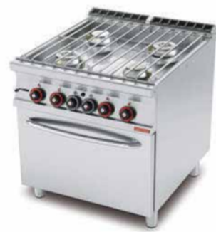
4 BURNER COOKING RANGE WITH OVEN