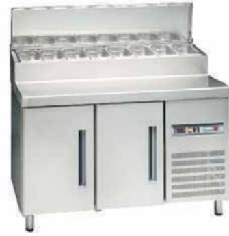
REFRIGERATED PREPARATION TABLE