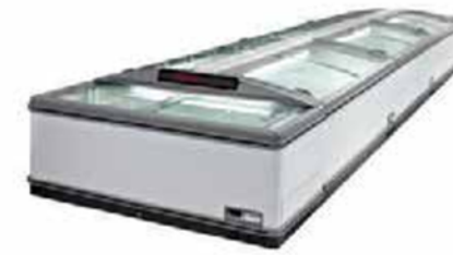
GLASS TOP FREEZER