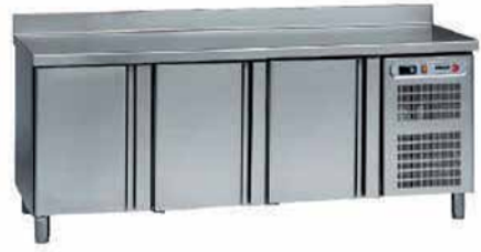
WORK TOP CHILLER / FREEZER