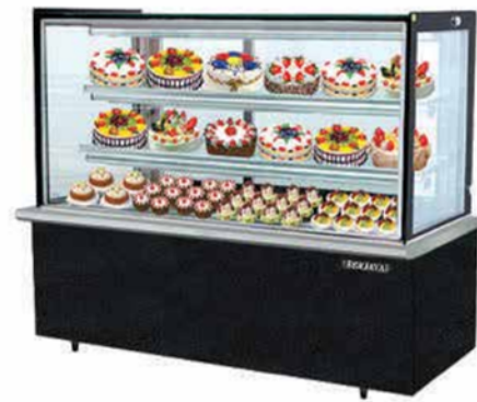
PASTRY DISPLAY CHILLER / HOT