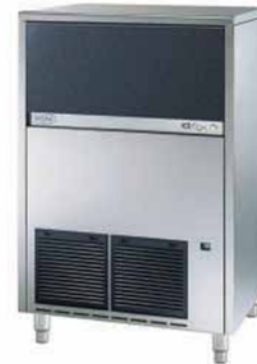
ICE MACHINE - CUBE / FLAKES