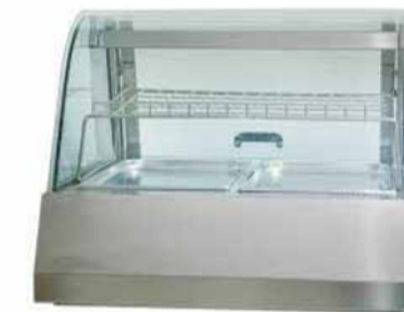
HOT & COLD DISPALY