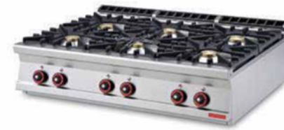
6 BURNER TABLE TOP COOKING RANGE