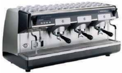
COFFEE MACHINE FULLY / SEMI AUTO