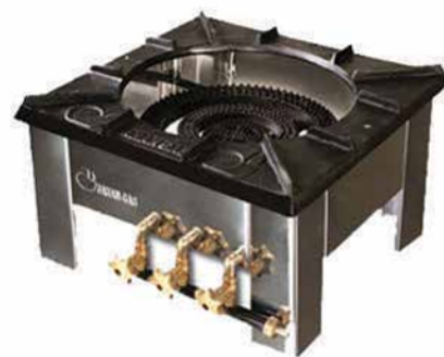
STOCK POT STOVE