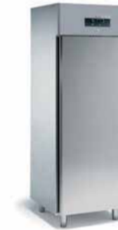
SINGLE DOOR CHILLER / FREEZER