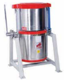
WET GRINDER TILTING