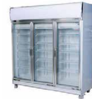
DISPLAY CHILLER-THREE DOOR