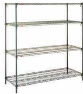
EXPOXY COATED SHELVING