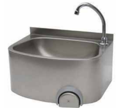
KNEE OPERATED SINK