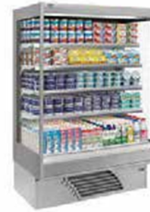
MULTI DECK CHILLER PLUG IN UN