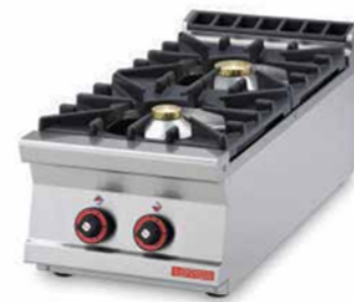
2 BURNER TABLE TOP COOKING RANGE