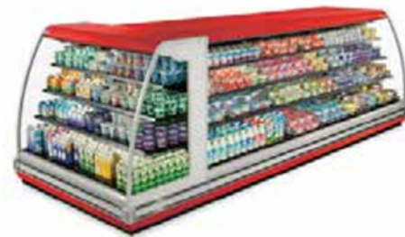
MULTI DECK CHILLER