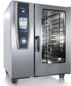
SELF COOKING COMBI OVEN