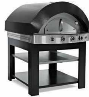
STONE PIZZA OVEN