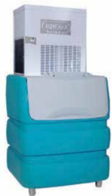
ICE MACHINE WITH BIN CUBES & FLAKES