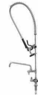
PRE RINSE UNIT