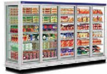
MULTI DECK CHILLER WITH GLASS DOOR