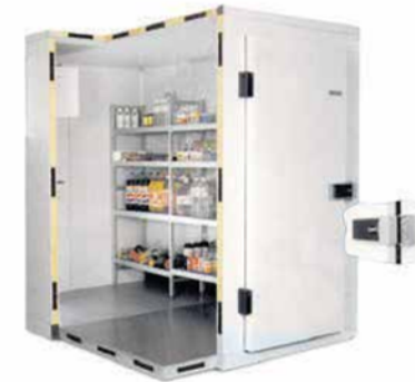
COLD ROOM - CHILLER/FREEZER