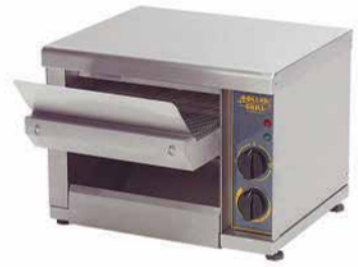
BREAD TOASTER CONVEYOR