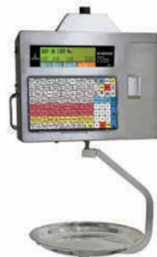
WEIGHING SCALE HANGING WITH PRINT