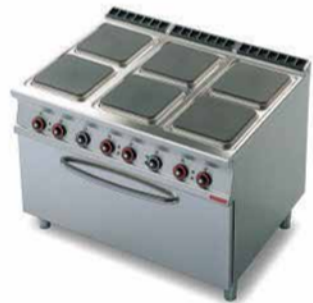
6 HOT PLATE WITH OVEN