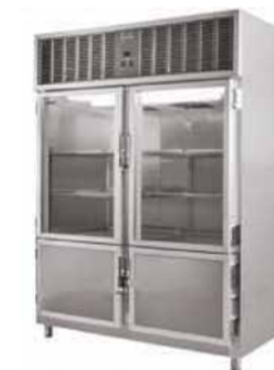
MEAT HANGING CHILLER