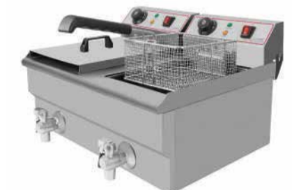
FRYER DOUBLE WELL