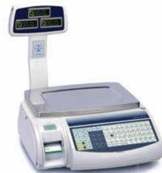
WEIGHING SCALE WITH PRINT