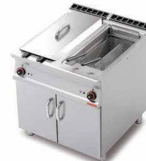
FRYER DOUBLE WELL