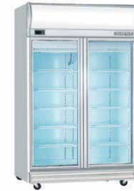
DISPLAY CHILLER- TWO DOOR