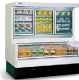
COMBINED MULTI DECK FREEZER