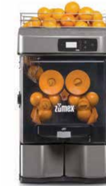
AUTOMATIC ORANGE SQUEEZER