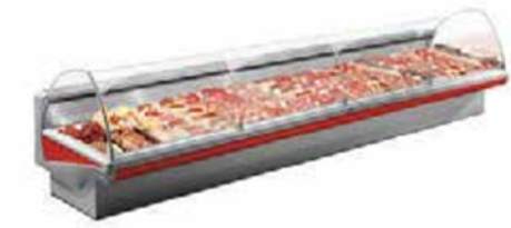
SERVE OVER COUNTER