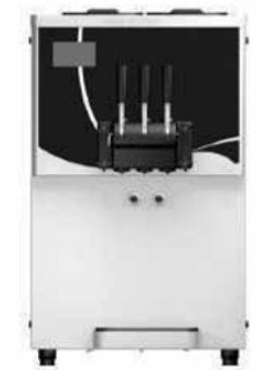
ICE CREAM MACHINE TABLE TOP