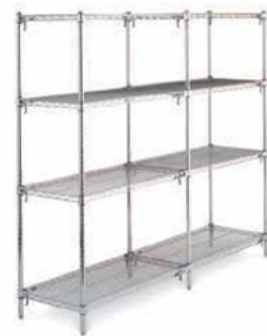
CHROME PLATED SHELVING