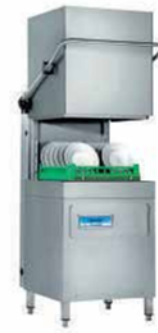
HOOD TYPE DISH WASHER