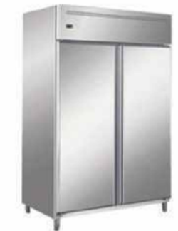
DOUBLE DOOR CHILLER / FREEZER