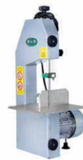
BONE SAW MACHINE