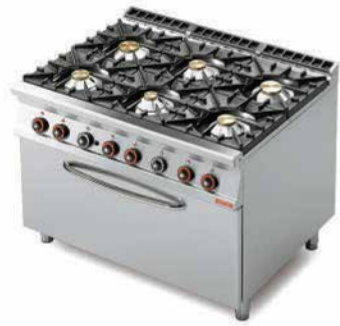
6 BURNER COOKING RANGE WITH OVEN