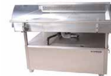
FISH DISPLAY CHILLER